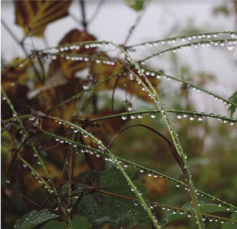
Detail: Untitled , Margherita Lamanno