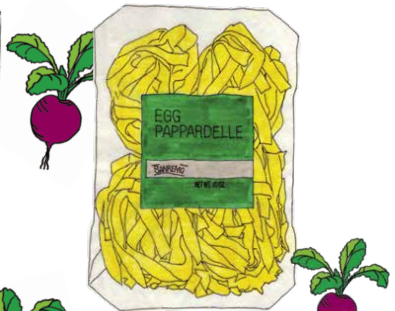
Compagnia San Remo EGG PASTA all 10 oz varieties $2.99