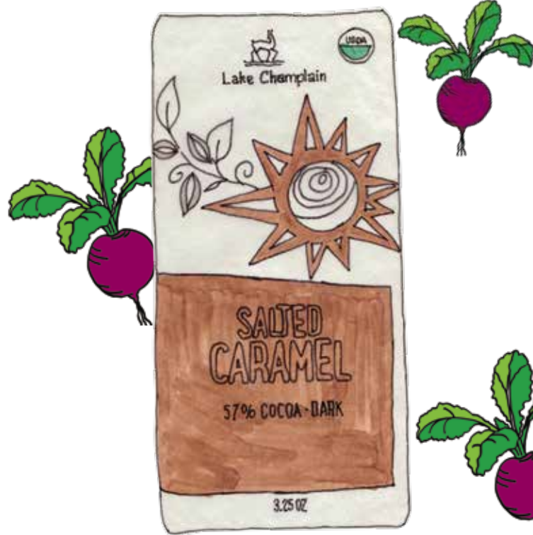
Lake Champlain ORGANIC CHOCOLATE BARS all 3 oz varieties $2.99