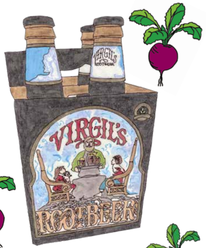
Virgil's 4-PACK OF 12 OZ SODA selected varieties $4.49