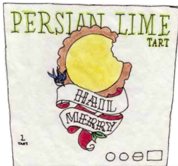
Hail Merry TARTS selected 3 oz varieties 2/$7